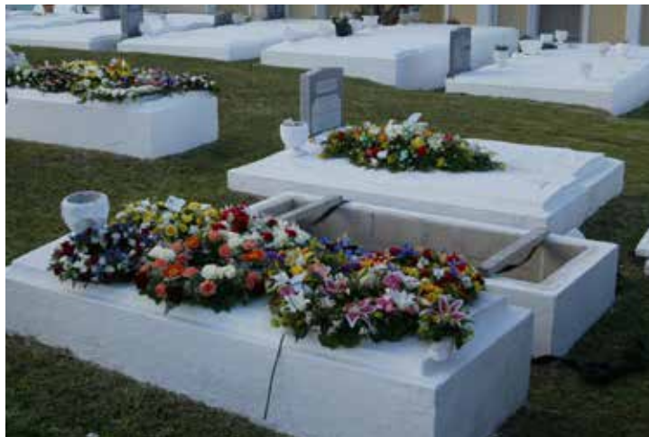
Table 5.1 shows a breakdown of deaths, by age groups, occurring between 2014 and 2018. The average age at death was 73.6 years for males, 79.3 years for females and 76.4 years for all persons in 2018.

In 2018, there were 532 residential deaths recorded; a increase of 51 or 10.6% from the 481 recorded in 2017