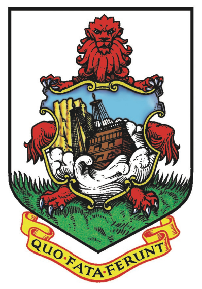
Ministry of National Security