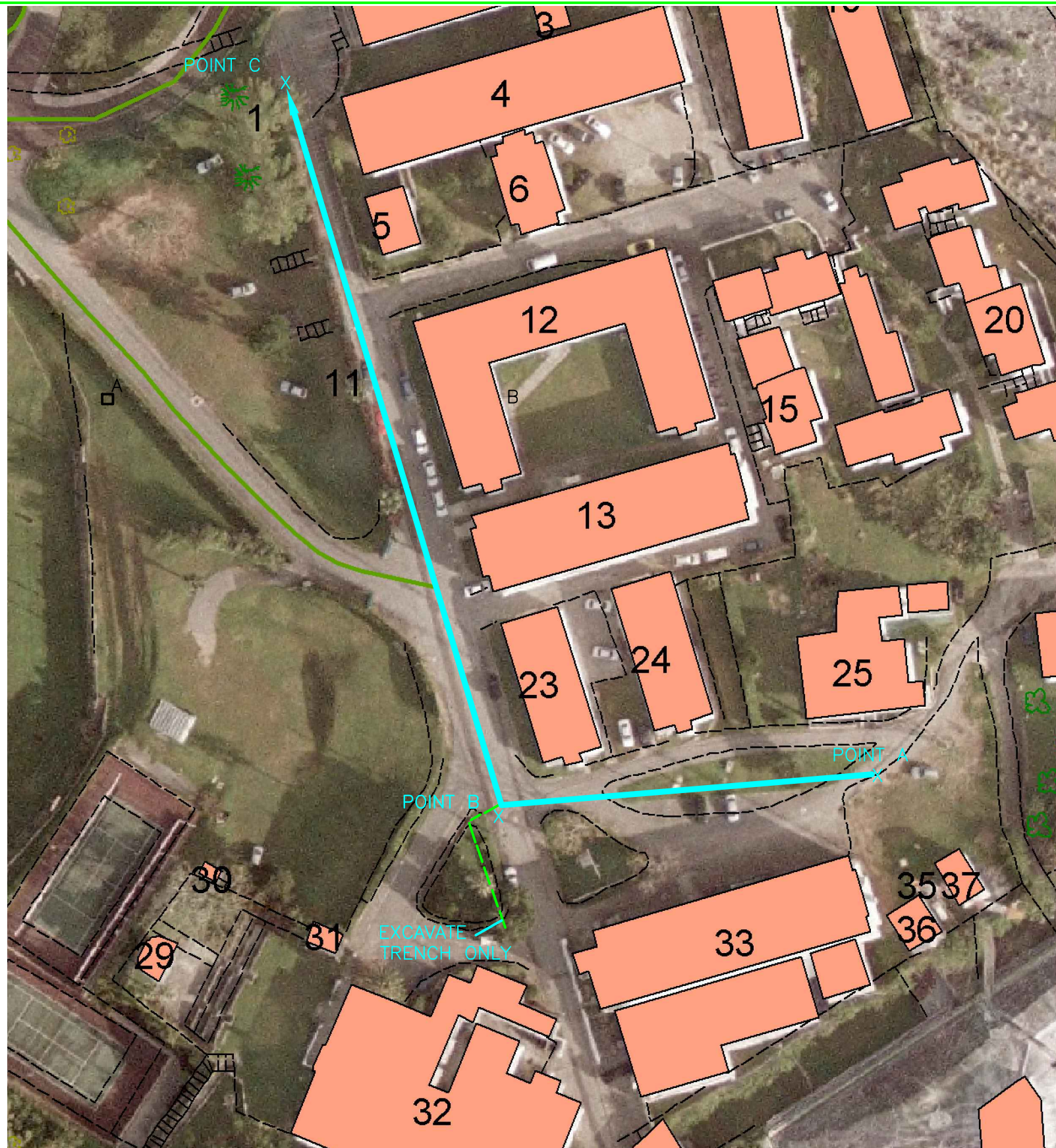
SITE PLAN N.T.S.